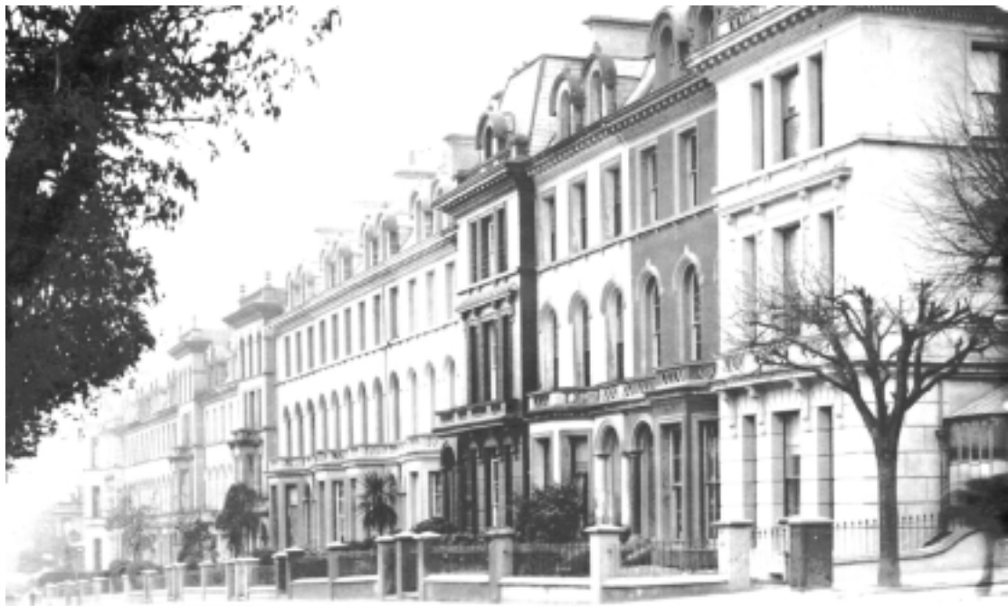
BELGRAVE ROAD TORQUAY.