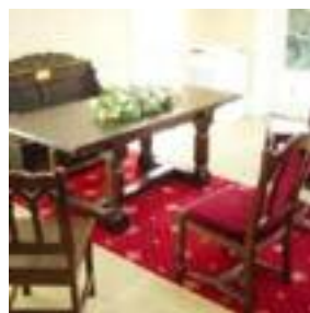
The Marriage Room York Register Office