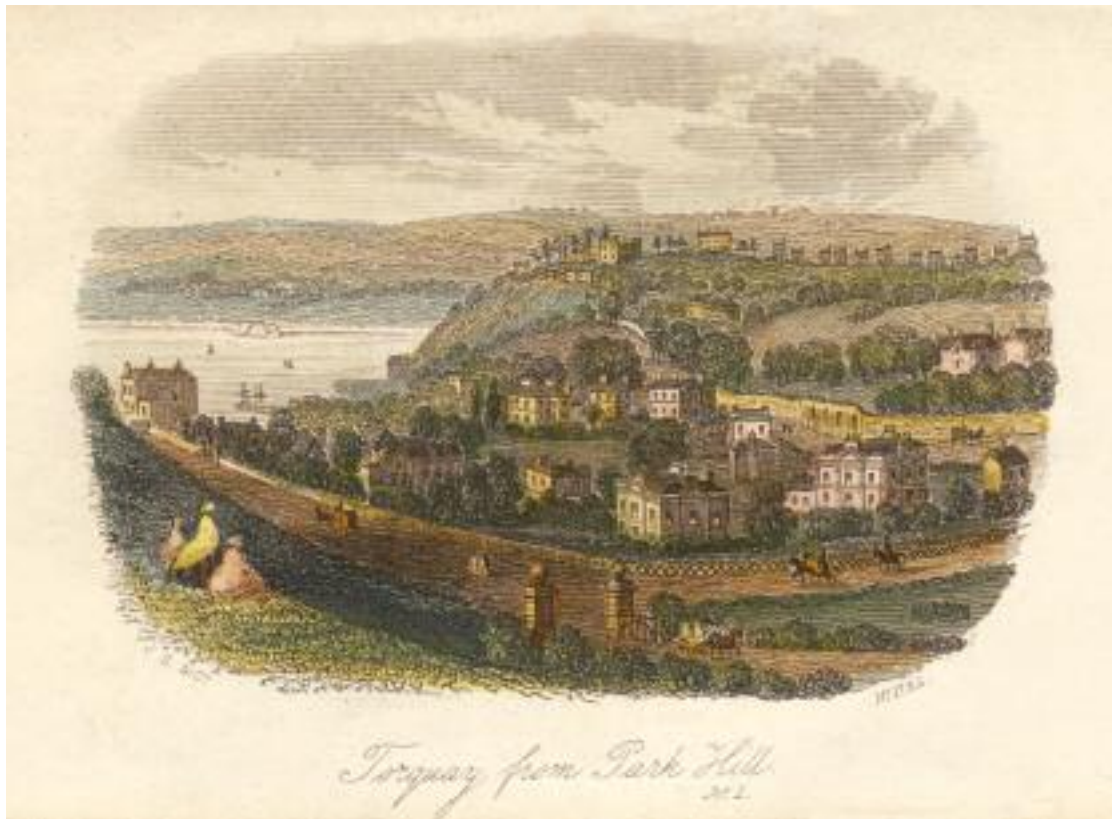
Looking towards the Warberries

And later another property of the same name