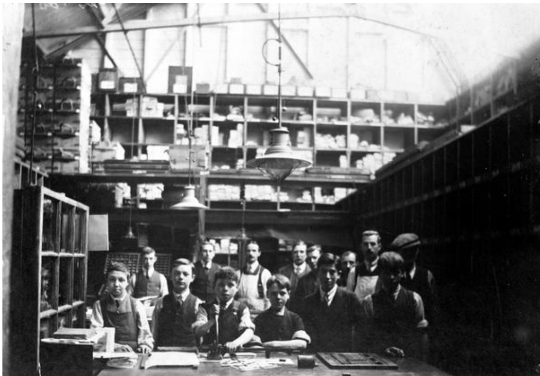
Printers Workshop Westminster