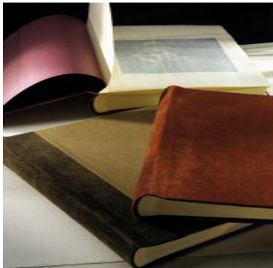
Books and Stationery