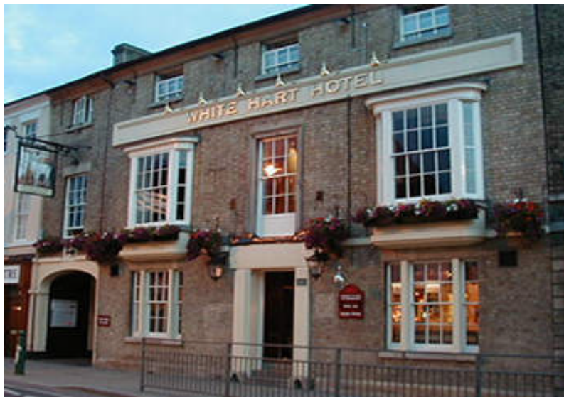
Connections with the White Hart can be recalled