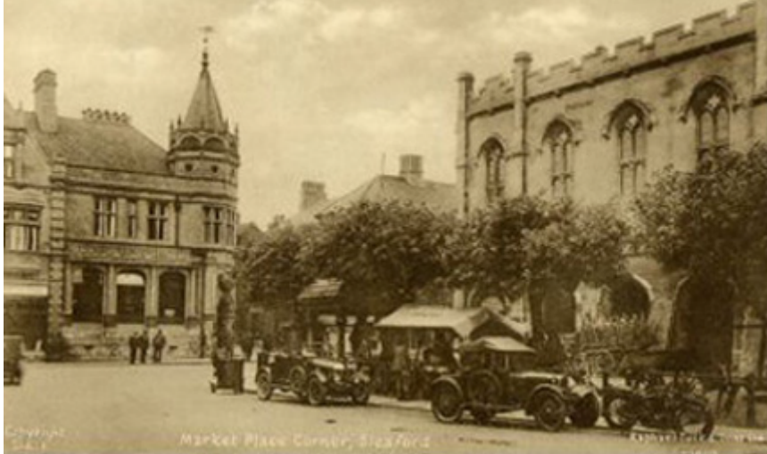
Market Place Sleaford