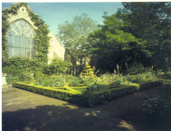
St Mary's Lambeth