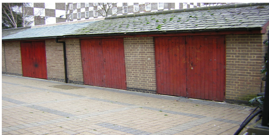
Old Stables in Esher Street today

Arthur had now moved to Oakley Street Lambeth