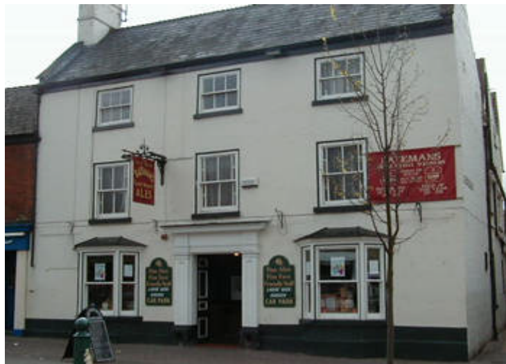
The Nag's Head Sleaford