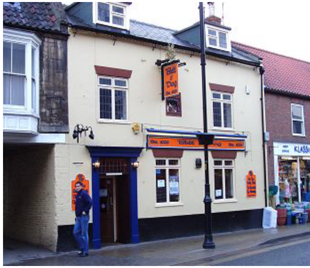
Bull & Dog Sleaford