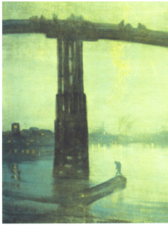
Old Battersea Bridge in Smog ( Whistler )

1891 daughter Jessie Newton Bird was born on 25 th April in Canada Wharf Lombard Road Battersea