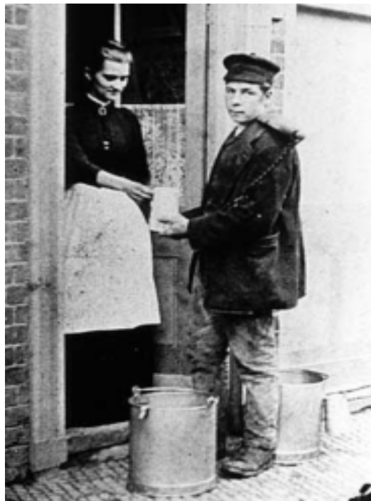
Milkman Brixton 1880's