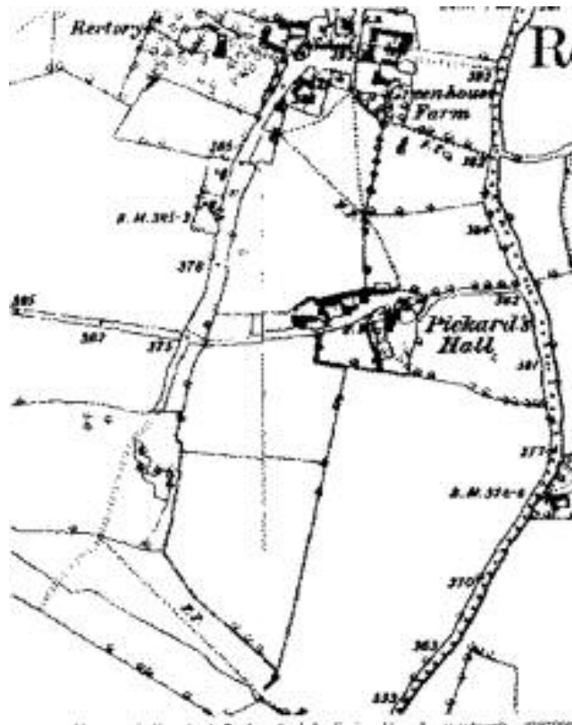
The Rectory Rede Green