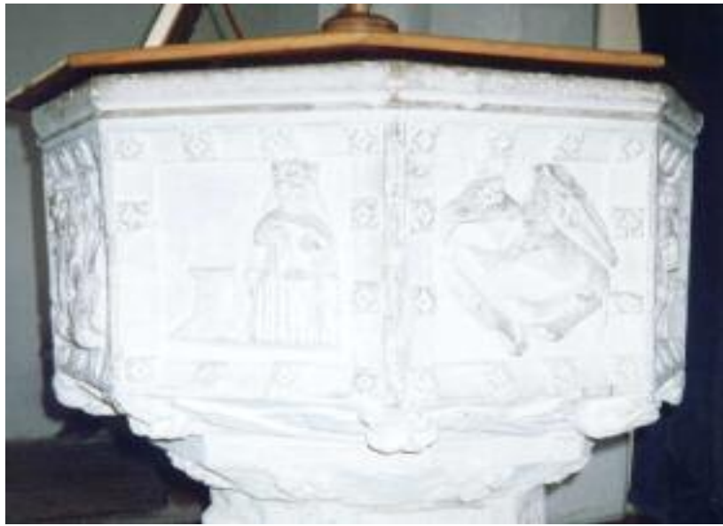
The Font at Glemsford