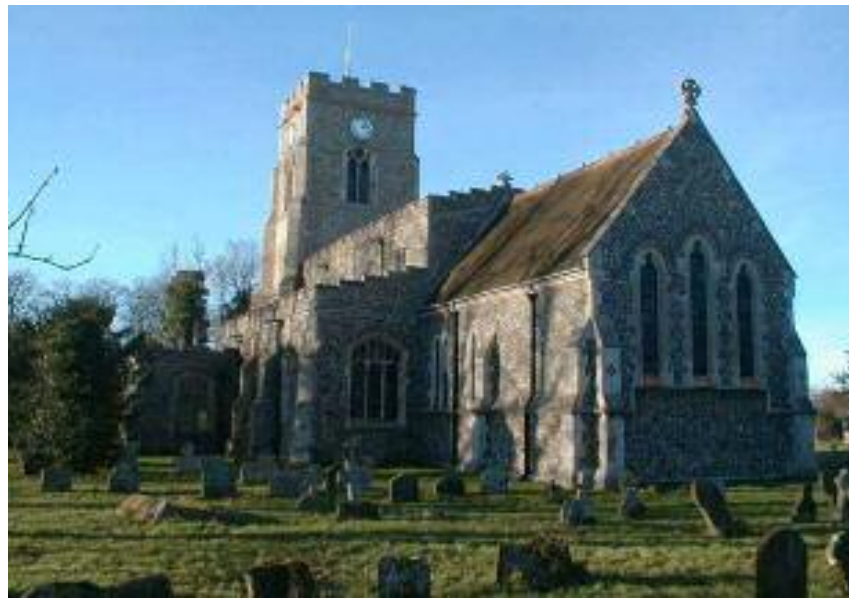
Lawshall Parish Church