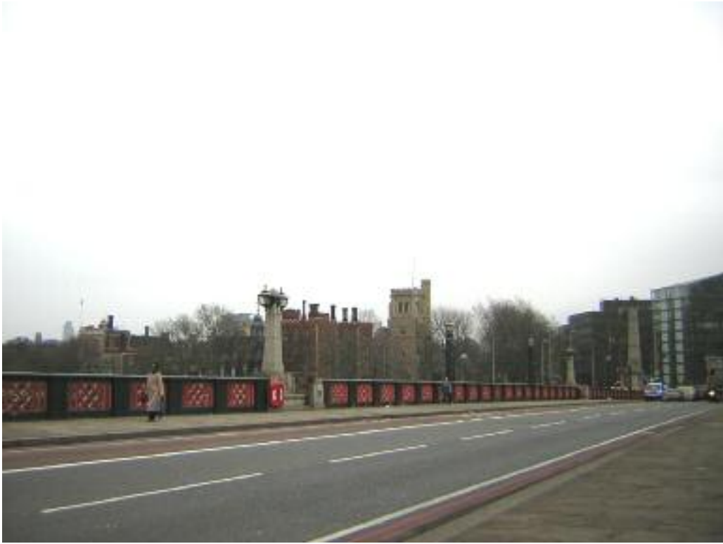
St Mary's today