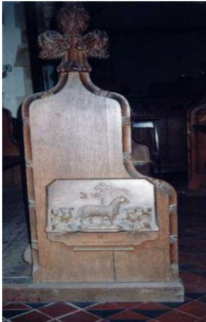
A typical pew at Rede church