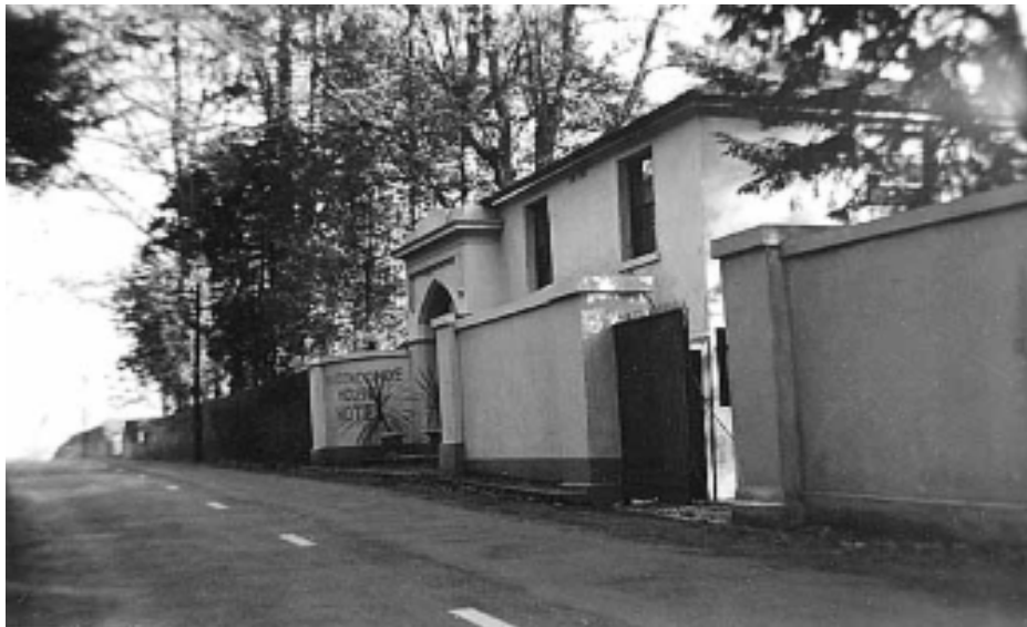
Maidencombe House Hotel