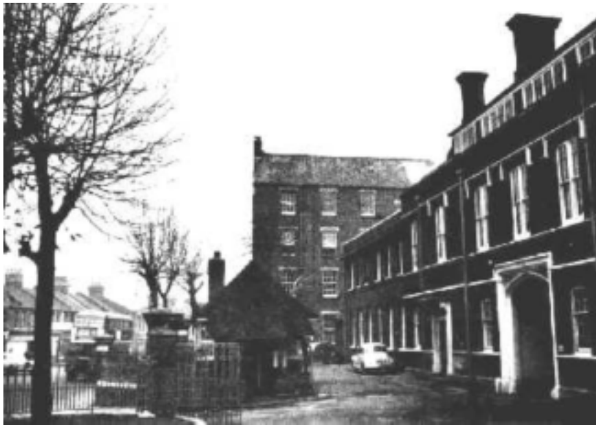
St Alfege's Hospital Greenwich