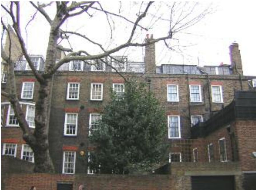
12 Wood Street today