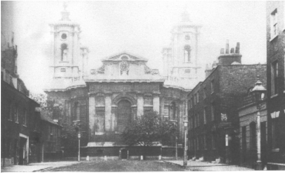
St Johns Smith Square from Millbank