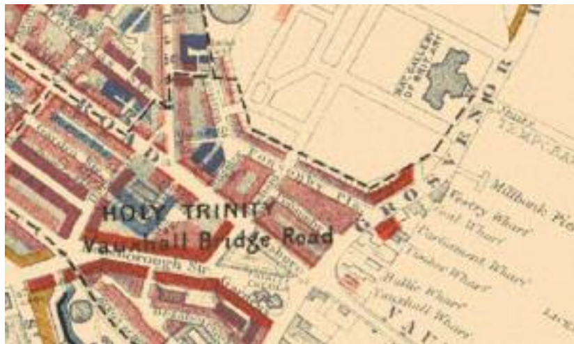
Ponsonby Place & Terrace