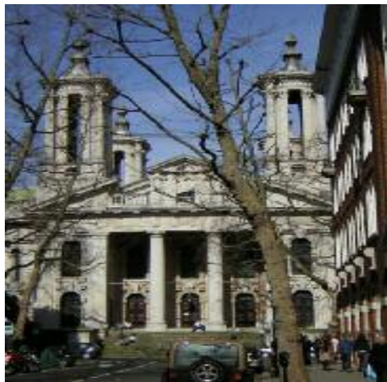
St Johns Today