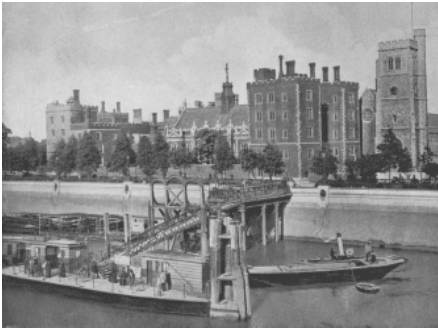
St Mary's church from Millbank