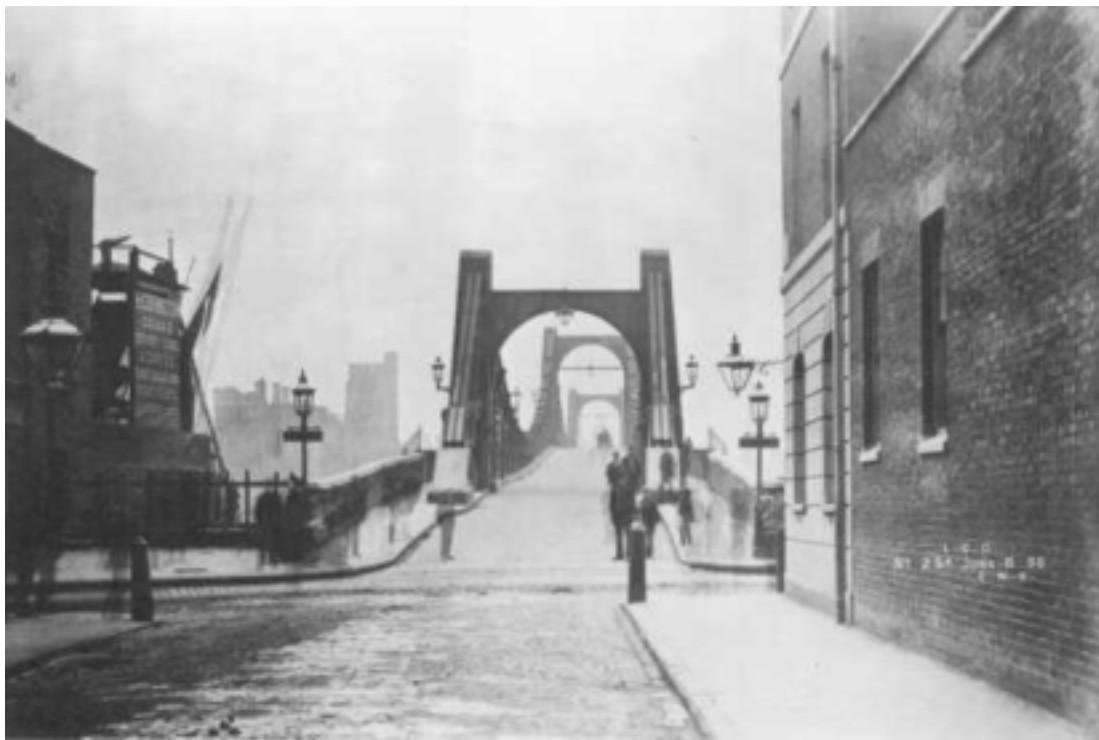
Lambeth Bridge built in 1896 Millbank St & wharfs on the left