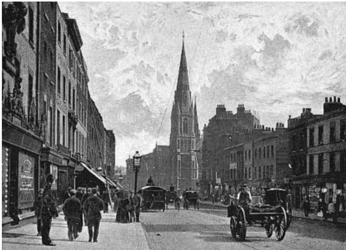
Christ Church Westminster