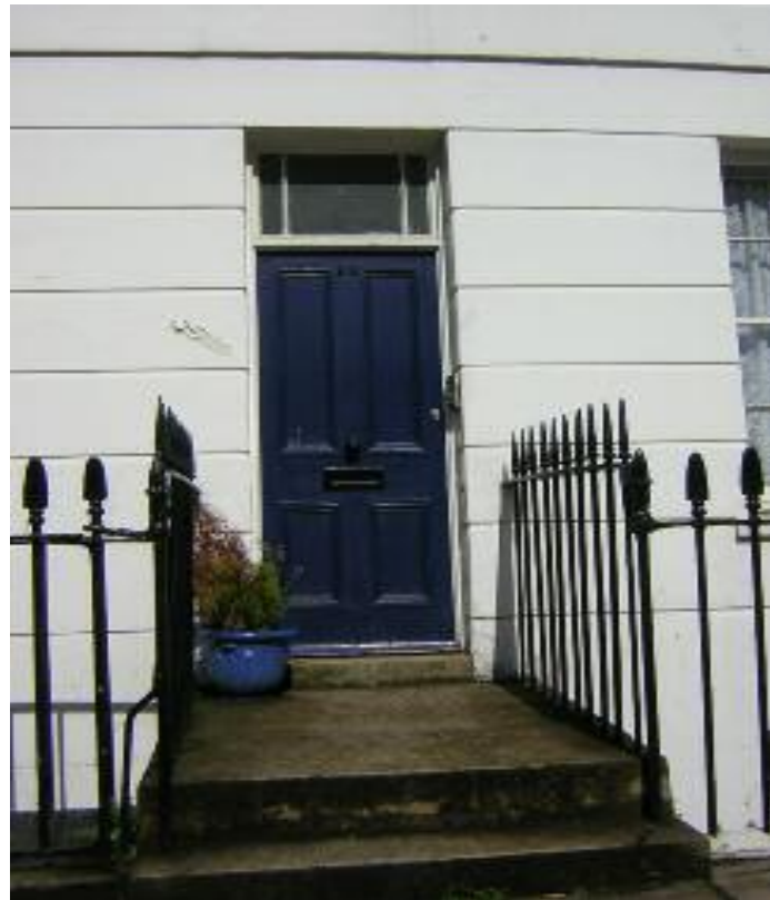
69 Ponsonby Place today