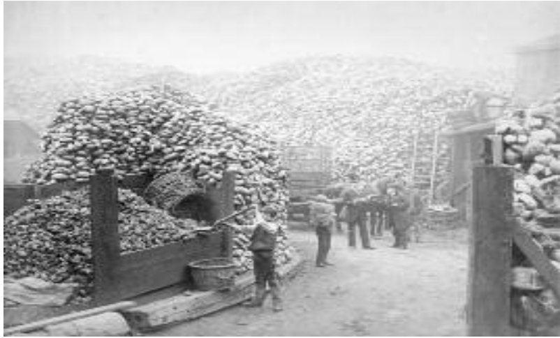
Coconut Fibre Works Millbank

Hydro Electric Plant. It was dark gloomy and grimy and described as a black mass of wharves by the Booth Surveys