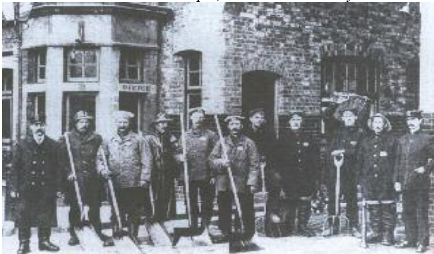
Westminster City Road Sweepers