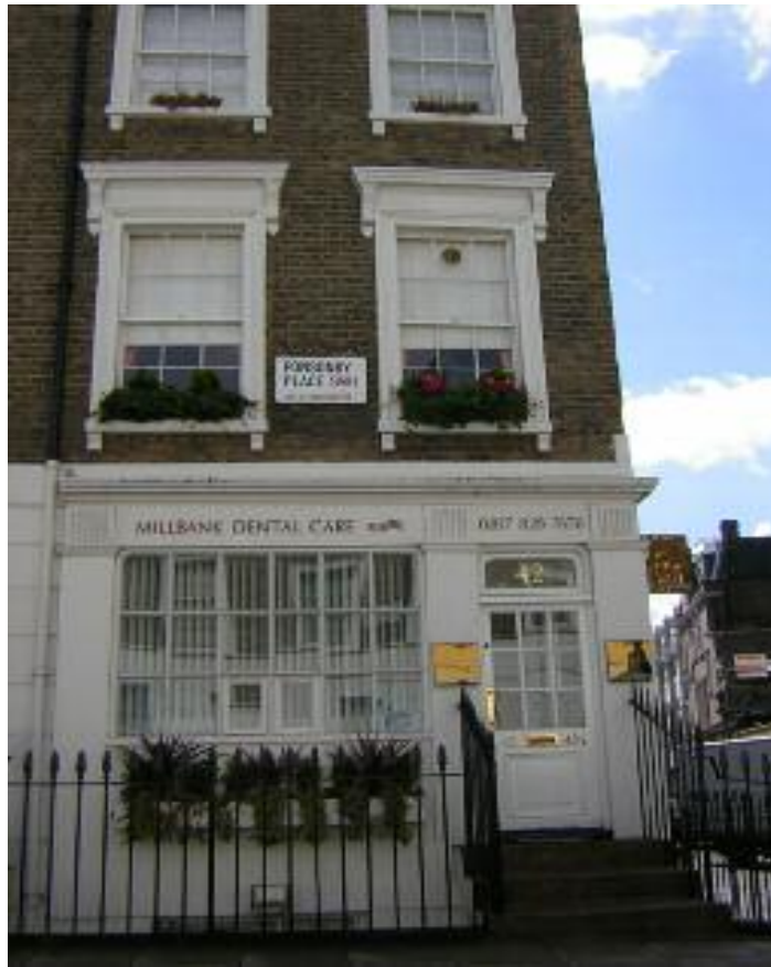
no 42 Ponsonby Place today