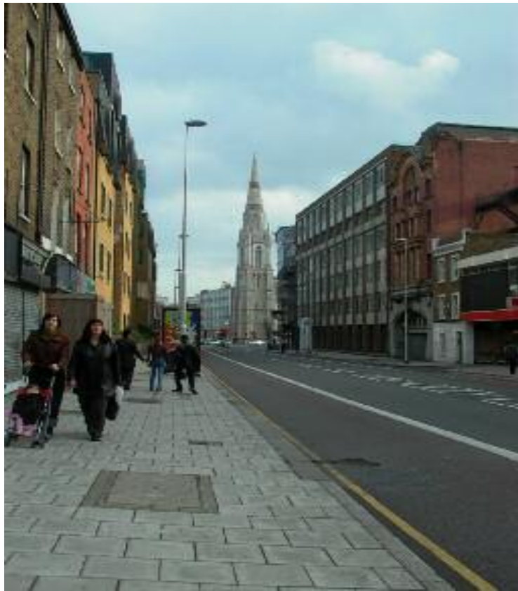
Christ Church Today