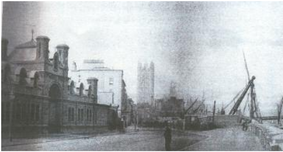
Millbank wharves view from the Prison