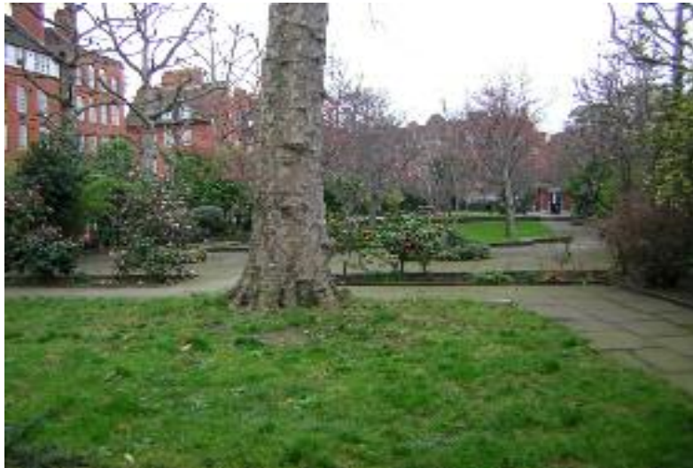
Gardens at Hudson's Terrace Today