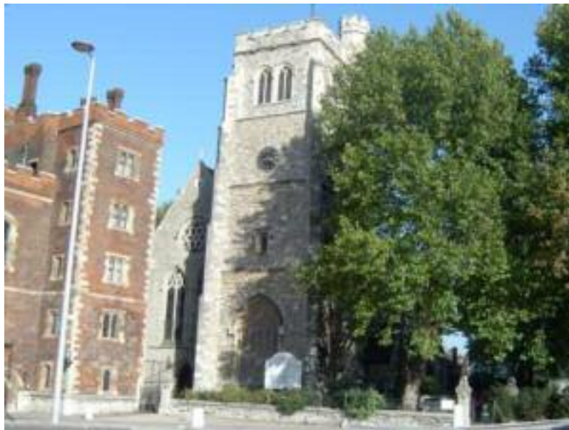
St Mary's today