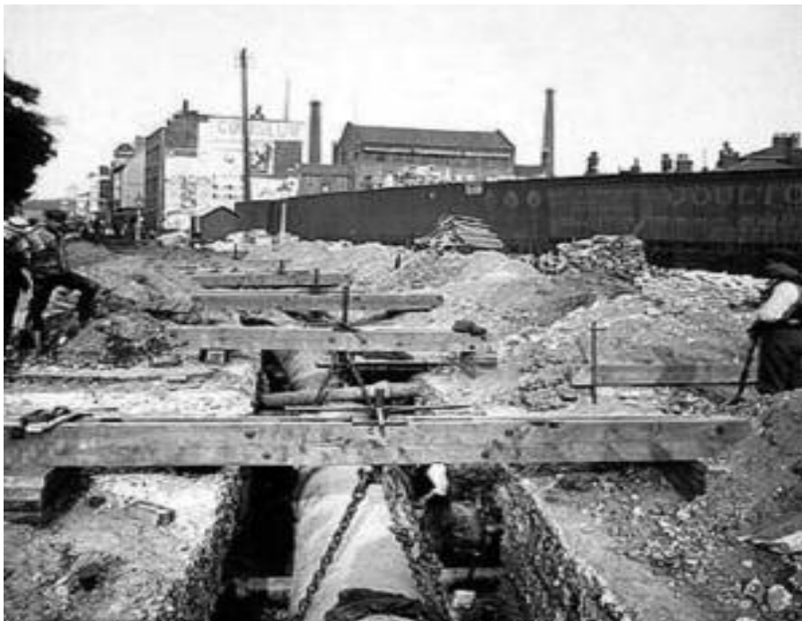
Gas pipe laying in Battersea

Many new gas pipelines were being laid all over London causing much dust and disruption.