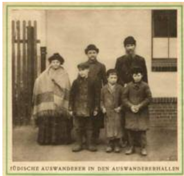
Jewish immigrants on arrival