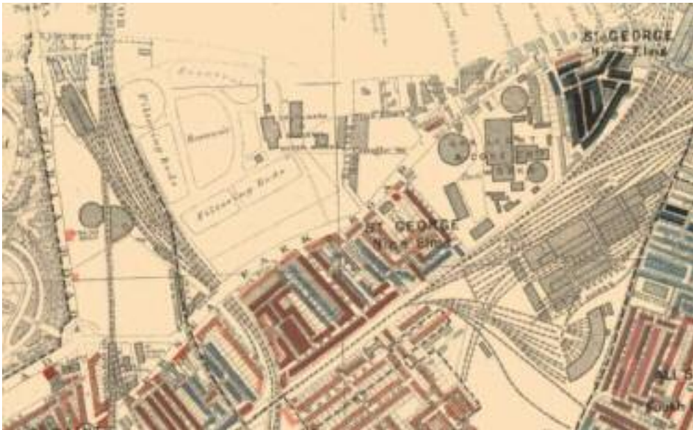
Site of the Nine Elms Gas Works