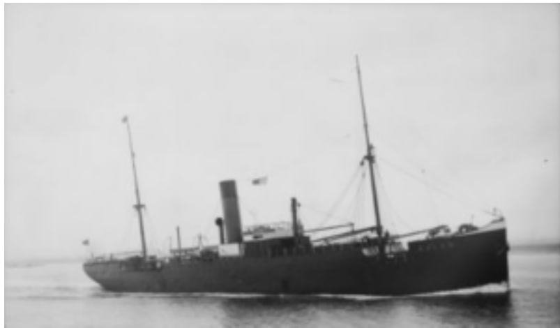
The 'Adler' operated on the Bremen to London route bringing Jewish emigrants from Eastern Europe

There appear to be many Powells on the New York passenger lists described as being born in Prussia.