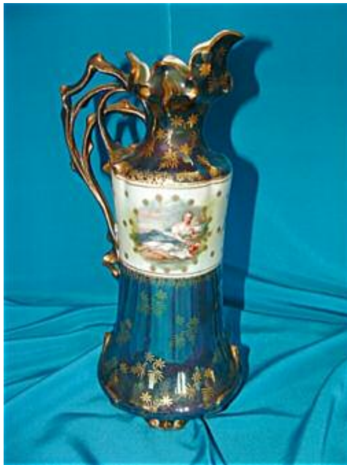
Example of Prussian Glass mid 1800's